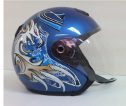
Helmet × 1 安全帽 × 1