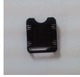
Remote Control Holder × 1 遙控器底座 × 1