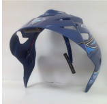
Wiper Module × 1 雨刷模組 × 1