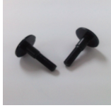
Long Screw × 2 長螺絲 × 2