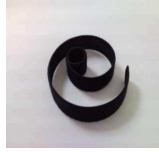
Removable Holding Strip × 1 可拆式固定帶 × 1