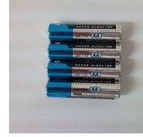
AA Batteries × 4 AA 電池 × 4