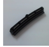
Spare Wiper Blade × 1 備用雨刷條 × 1