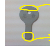
Special Screw Driver × 1 專用螺絲起子 × 1